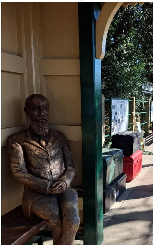
Wheathampstead Station – GB Shaw still waiting for a train

Like many, the station was closed in the mid-sixties following the Beeching report and the platform became stranded on its embankment as surrounding tracks and bridges were removed as the village developed.