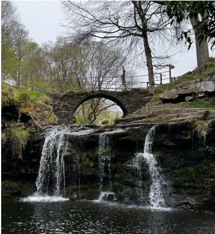
Lumb Hole Falls – Lack of rain means less impressive than normal