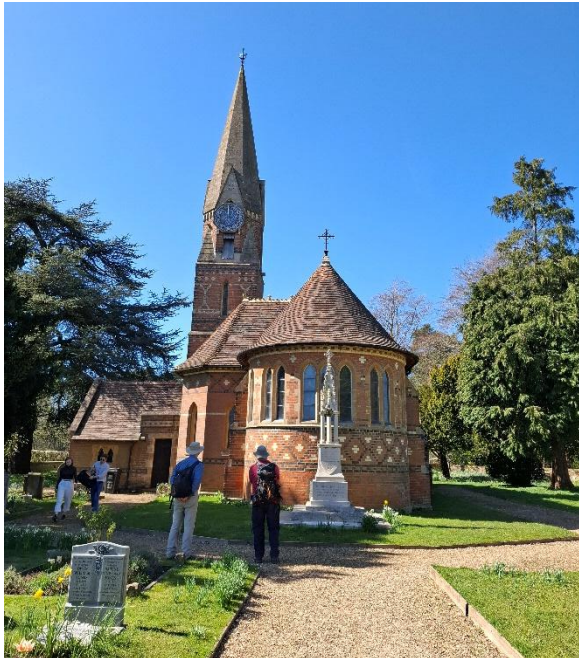
St Peter's Church

Once clear of the village, we soon joined the Ayot Greenway which is a footpath along the old railway which joined Wheathampstead to Welwyn Garden City. After a couple of miles, we turned off to Ayot St Peter's to see the beautiful Arts and Crafts St Peter's church. It was